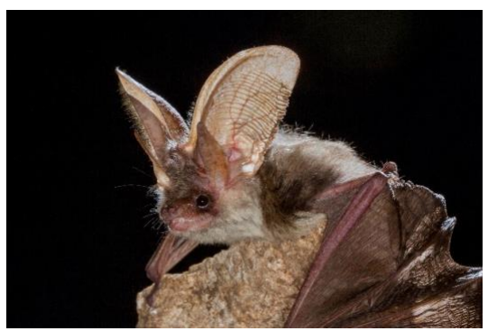
Plecotus kolombatovici

Knowing the distribution of mammal species is essential for their protection and hopefully will promote scientific research on mammals in Europe.