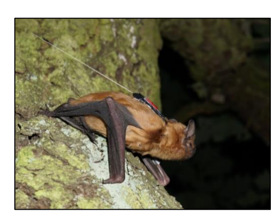
Common noctule bat ( Nyctalus noctula ) carrying a bio-logger for encounter detection

movement data. A recent meta-analysis on 57 GPS-tracked species of mammals